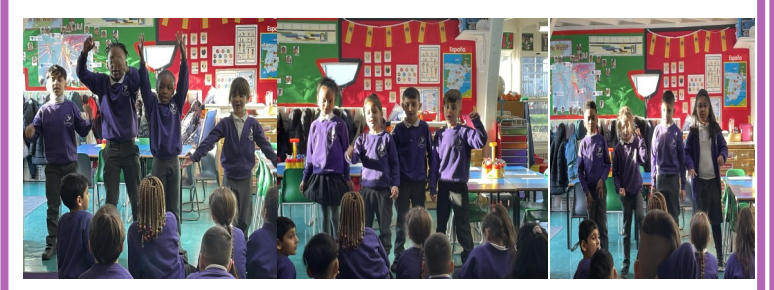
Year 2 Year 2 have been working really hard in Maths and practicing subtraction using column method.

In Science, we have started our exciting new topic 'Everyday Materials', the children will be taking part in lots of different experiments.