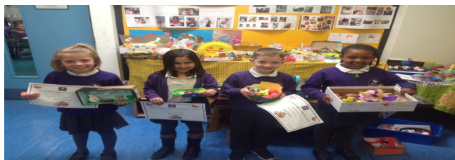
Year 1 Winners and runners up.