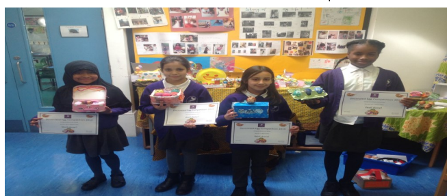
Year 5 Winners and runners up.