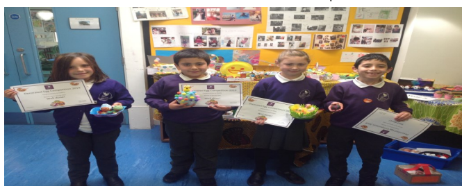
Year 3 Winners and runners up.