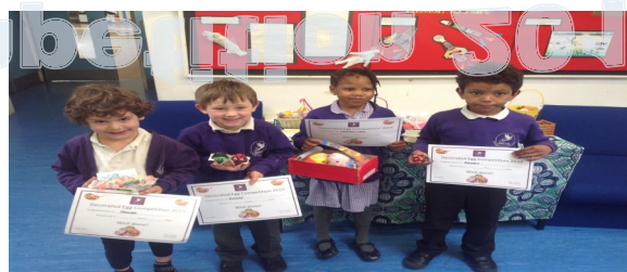
Reception Winners and runners up.