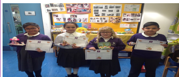
Year 4 Winners and runners up.