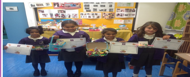
Year 2 Winners and runners up.