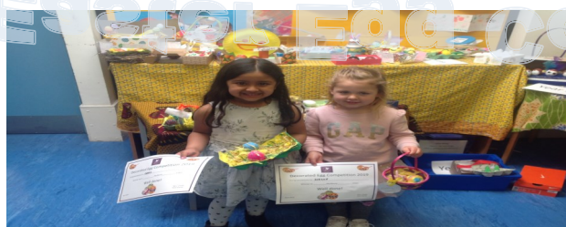
Nursery Winners and runners up.